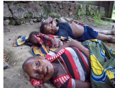
SOME PHOTOS OF VICTIMS OF THE MASSACRE BY INTERAHAMWE TO KAMANGA /BUNYAKIRI

There are many massacres accomplished by the FDLR /Interahamwe (Forces démocratiques pour la libération du Rwanda) in villages of South Kivu and North Kivu Provinces . These are militias chased from Rwanda after committing the genocide in 1994. The balance-sheet published by some local organizations shows thousands of people killed; many others have been injured, many women raped and infrastructures destroyed ... These rebels have looted the properties. Those who flew away to look for safe areas live in poverty and miss hygienic supplies. This situation has caused the creation of RAI A MUTOMBOKI who are local defense forces.